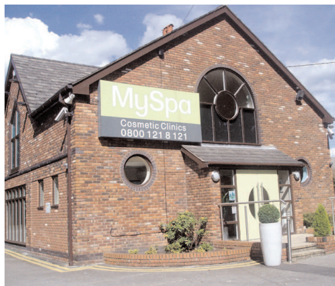
LATEST TECHNIQUES... MySpa's three for two facials and the clinic in Adlington