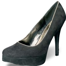
MARISSA SHOES £20