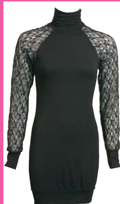
MELINDA DRESS £18

CAPRICORN 22nd Dec – 20th Jan Best Date: Pisces Worst Date: Gemini