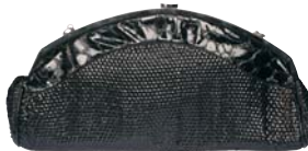
BETSIIE CLUTCH £15